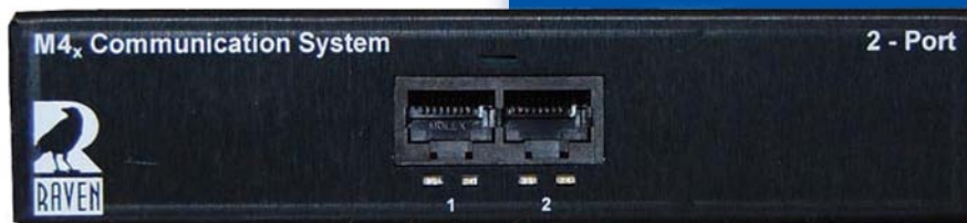
One 2-Channel Module, 2 ports