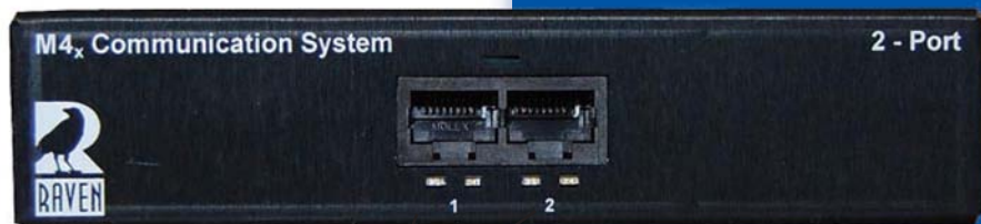
One 2-Channel Module, 2 ports